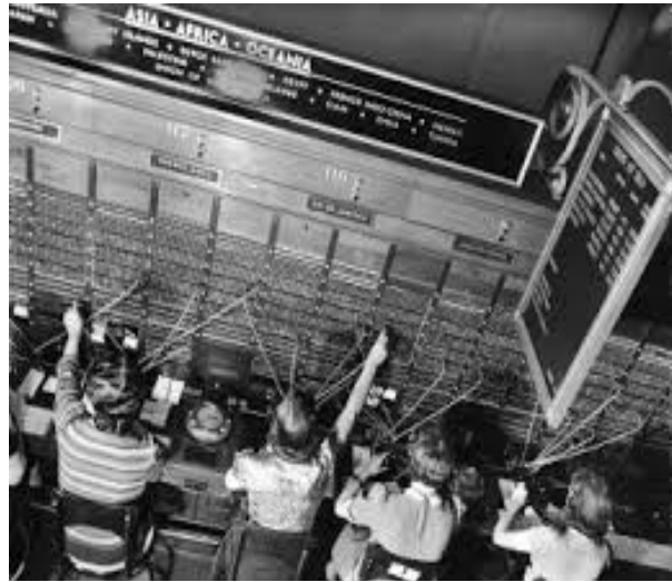
Old wall phone operator circuit board