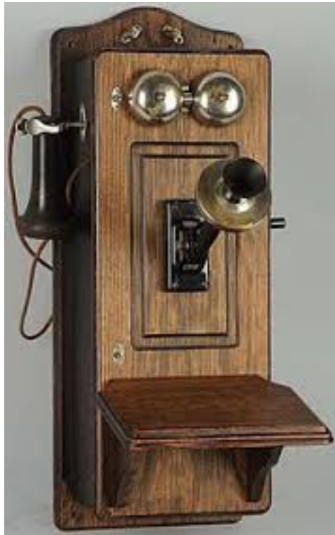
Old wall phone